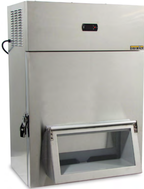
Wall Mount Kit Included