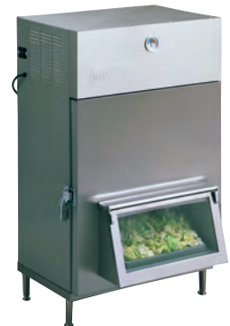
SK2SB/C1 (Shown with counter stand)