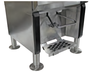
SKMAJ1/C3 w/ Shipboard Legs